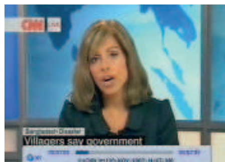
The PVR features are unique at this price point, but they are very basic, with no live cache or fast-forward and rewind controls