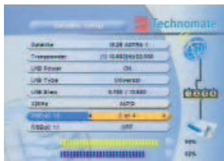
Useful onscreen graphics accompany the installation menus to make the setup process more intuitive

It's a useful bonus too, and so is the component video output. Both features add to what is already a very flexible, accomplished, and low-cost receiver ■ Geoff Bains