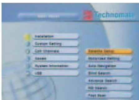
The TM-5200's menu layout is simple and easy to navigate, with all of the options laid out in clear English

The only item lurking under the front panel flap is the USB 2.0 connector. That's very handy when using this for updating the receiver's software, or even playing MP3 files or displaying digital photos on your TV, through the TM-5200D. But if you want to permanently make use of the TM-5200D's recording capabilities, then this is the last place you want to connect a memory stick or hard drive. Like the