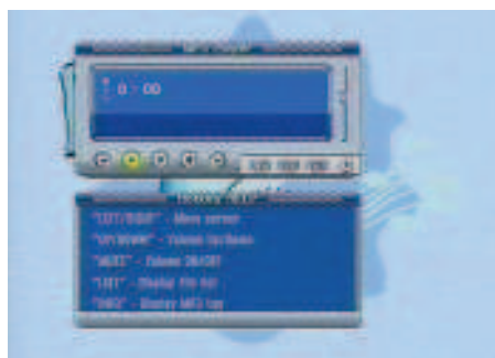
A simple MP3 player and JPEG file viewer are included for files on USB storage, which is very unusual on a budget receiver