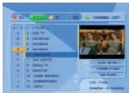
With memory for 10,000 channels, it's fortunate there are many ways to organise them, and a handy A-Z shortcut on the remote